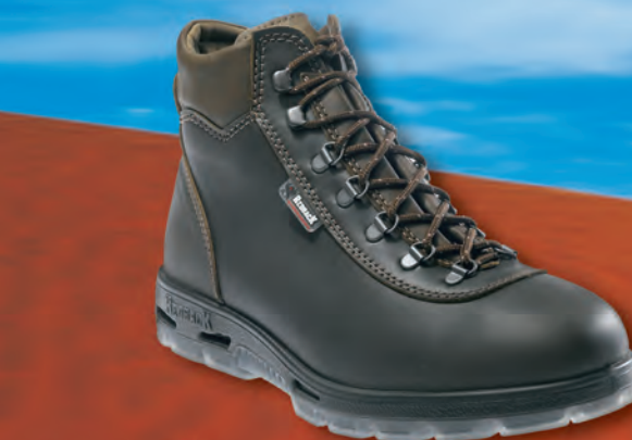
EVEREST PUMA AQUAPEL UEPU (Non Steel Toe) Sizes 2-13 (4½ to 11½)