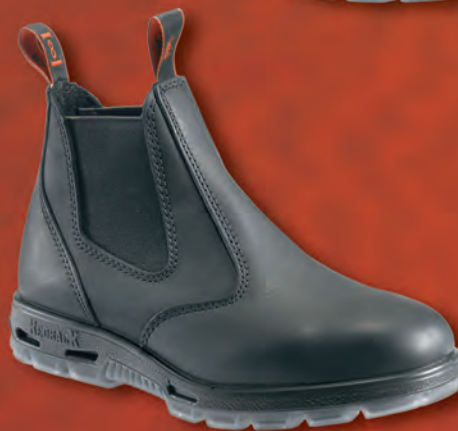
BOBCAT BLACK KIP UBBK (Non Steel Toe) Sizes 2-13 (4½ to 11½)