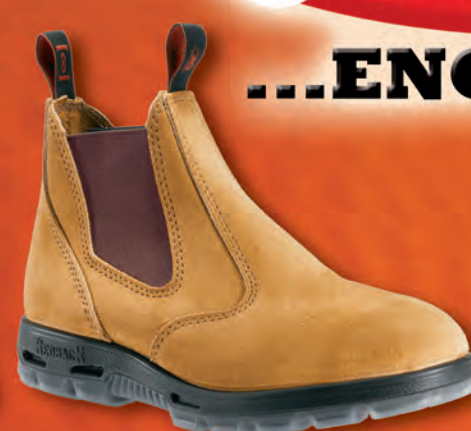
BOBCAT BANANA SUEDE UBBA (Non Steel Toe) Sizes 2-13 (4½ to 11½) USBBA (Steel Toe) Sizes 2-13 (4½ to 11½)