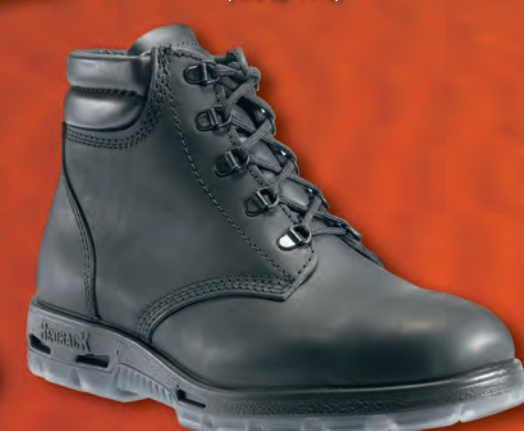
ALPINE BLACK KIP UABK (Non Steel Toe) Sizes 2-13 (4½ to 11½)