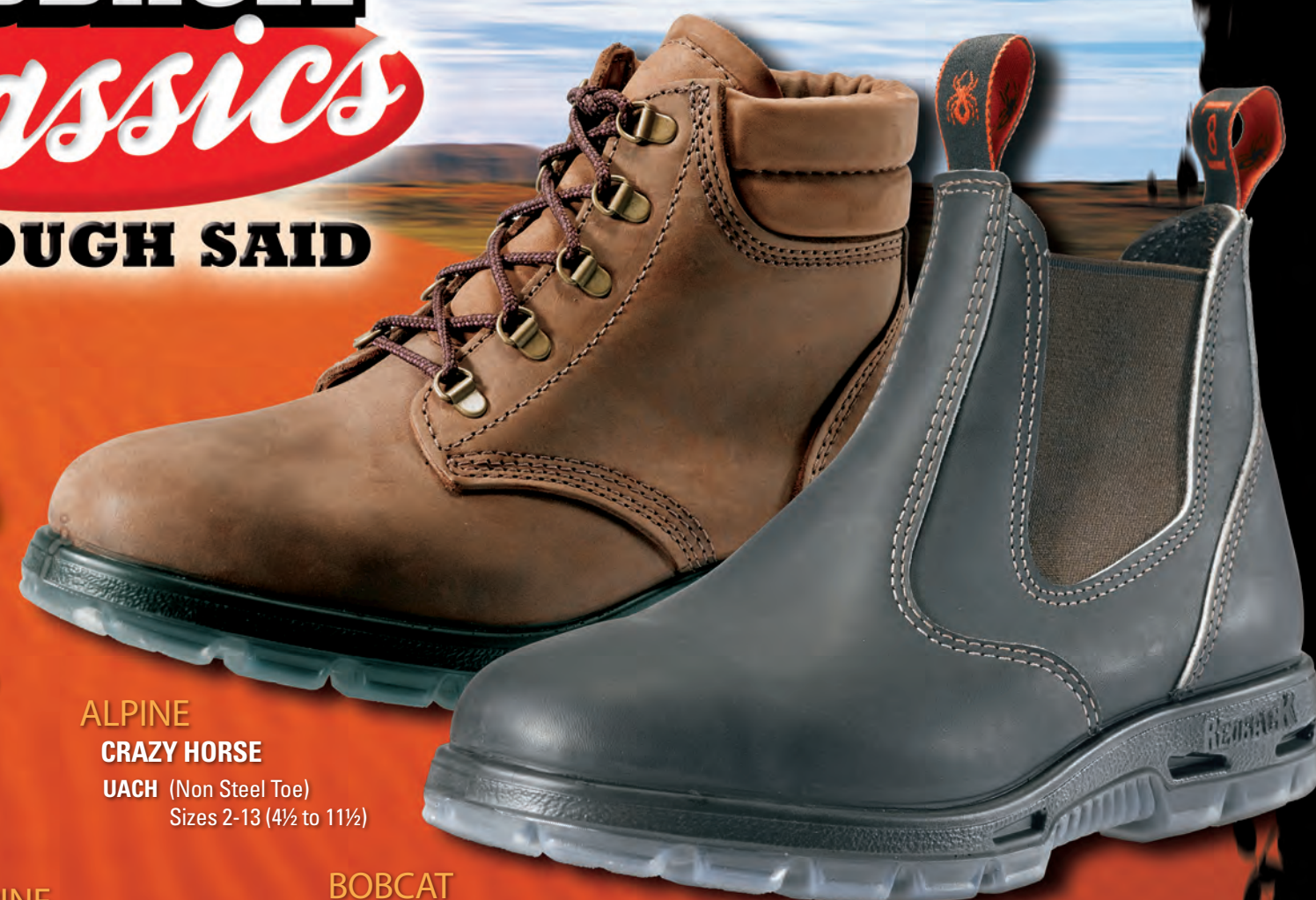
ALPINE CRAZY HORSE UACH (Non Steel Toe) Sizes 2-13 (4½ to 11½)